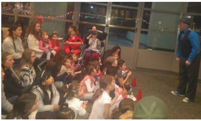
A magician entertains the children, and a few adults, at the annual Children's Holiday Party.